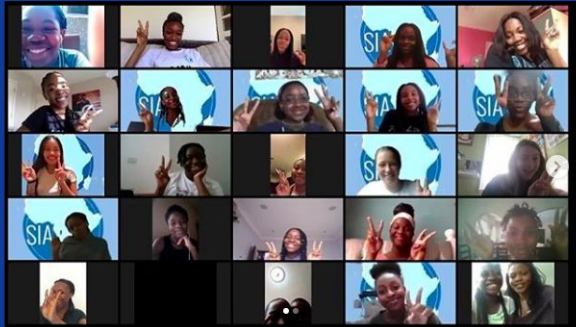
SMA Call 2.0