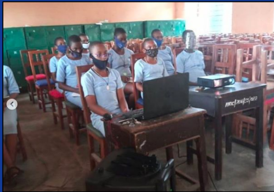
Students from Holy Rosary International College, Owerri, at one of our mentorship calls.

Our monthly calls provide educational support to our mentees but also provide a space for mentors and mentees to share their dreams and aspirations with each other.